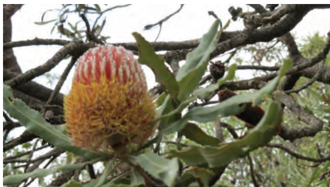
Left: Banksia menziesii in the Dawn Atwell Reserve