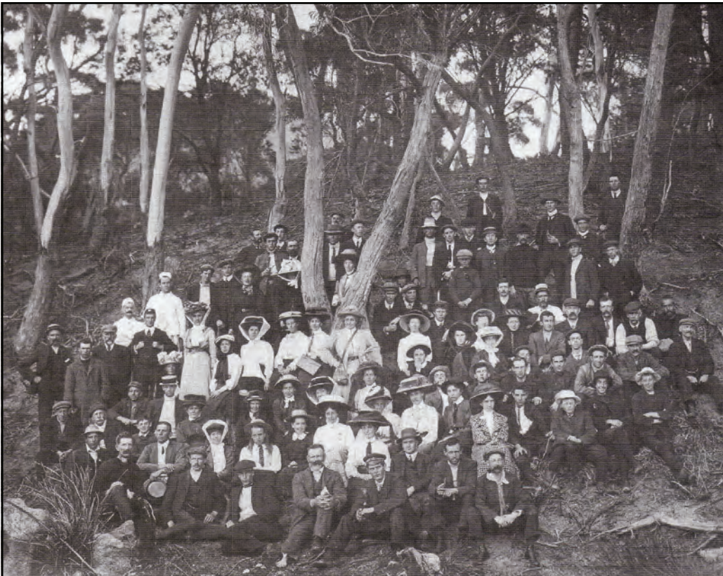
Left: Tasmanian Field Naturalists Club excursion, in 1910.