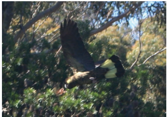
Above: Yellow-tailed Black Cockatoo