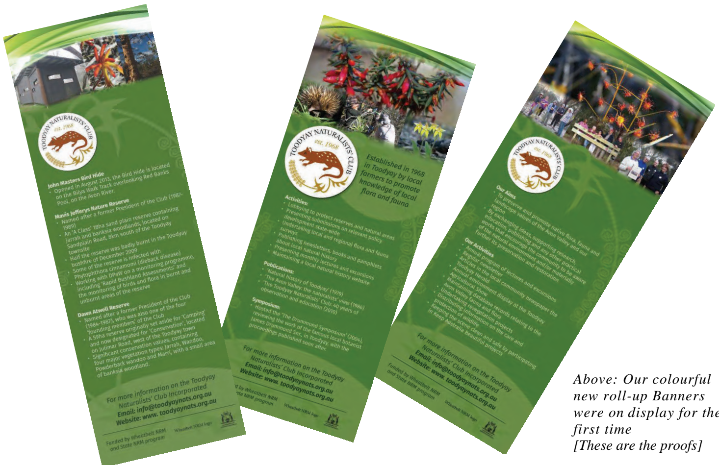
Above: Our colourful new roll-up Banners were on display for the first time [These are the proofs]