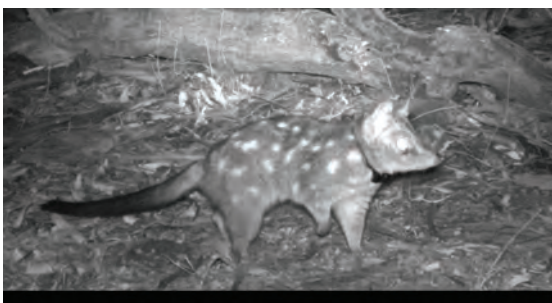
Above: Idnya within release pen Right: Tina Schroeder radio tracking quolls

SAAridlands@sa.gov.au with the subject 'Quoll update' and you will be added, or phone (08) 8648 5300