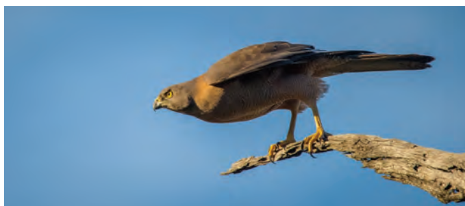
Above: A Brown Goshawk about to take flight. This was a parent of the Goshawk on the opposite page. In the November Toodyay Herald a photograph of the bird in the bird bath opposite appears whilst still a nestling