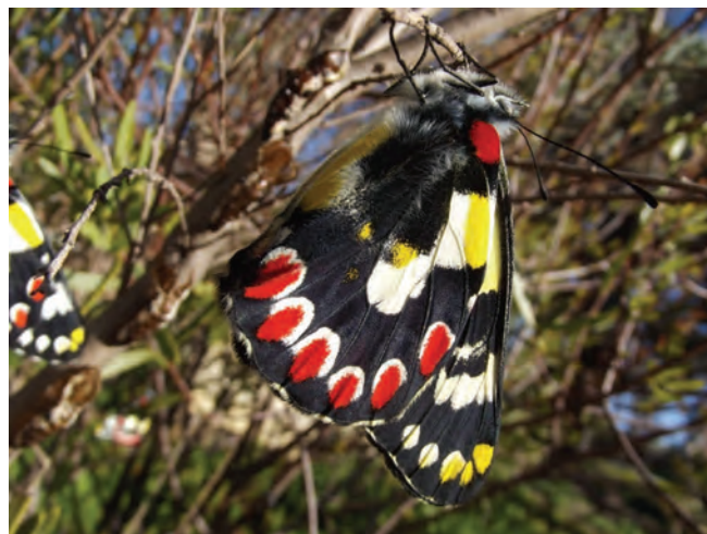
Above: Red-spotted Jezebel on young sandalwood tree.