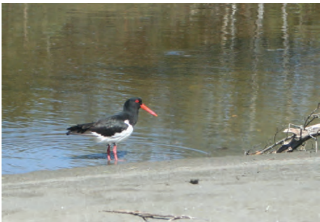
Above: Pied Oystercatcher

We left 7.30am Tuesday October 21 to catch the early morning ferry to Bruny Island a major breeding area of the tiny, 32-34cm, Blue Penguin and Short-tailed Shearwater. Chicks, possibly the penguins, could be heard calling from their burrows.